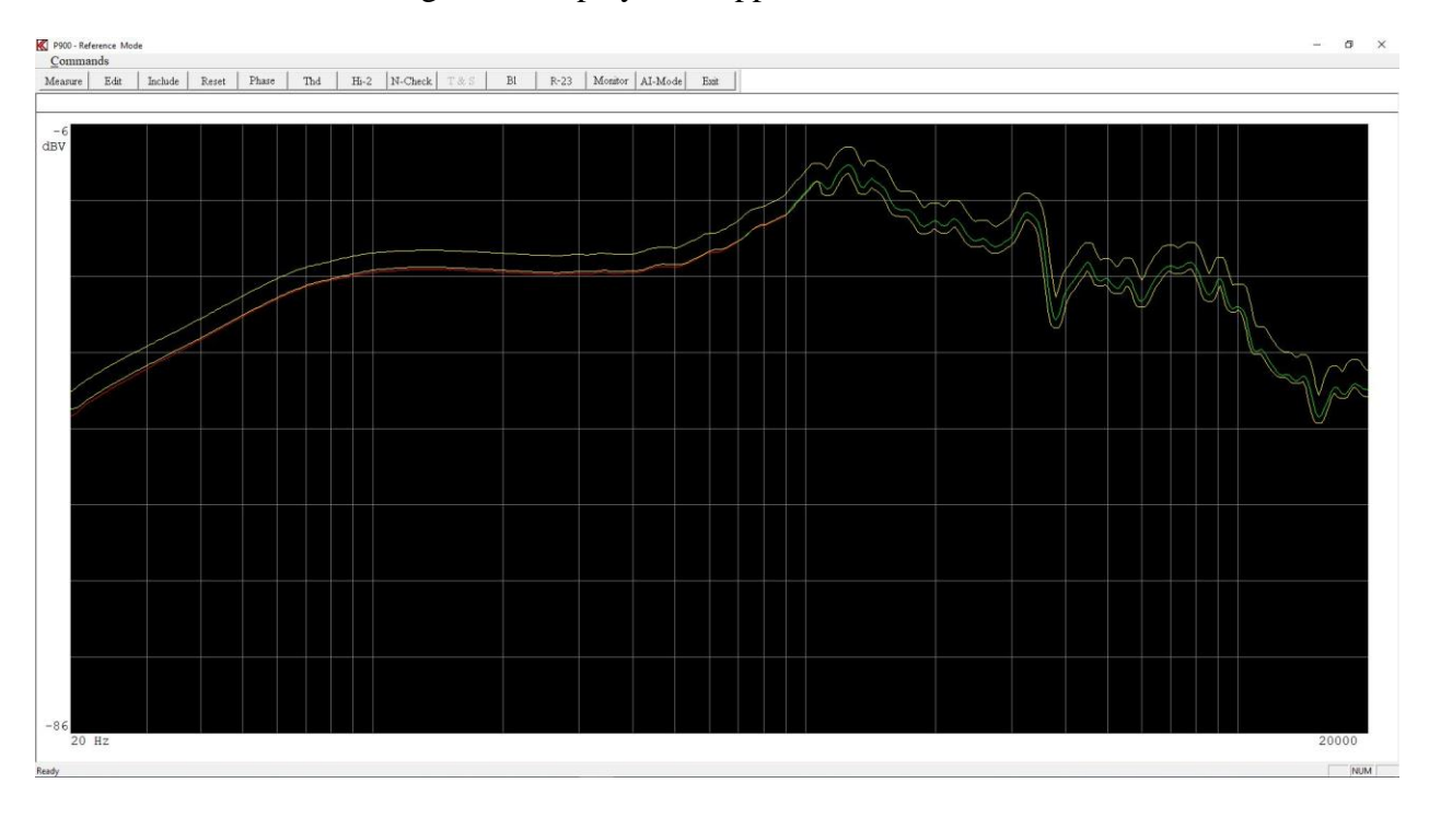
Figure 3: Measurement with a different device of same type.

Figure 3 show a measurement of another device of same type. Note the signal level is lower for this measurement than the device tested on figure 2.