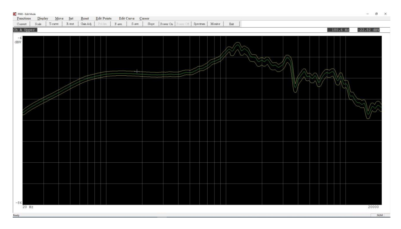
Figure 2: Display with upper and lower limits.