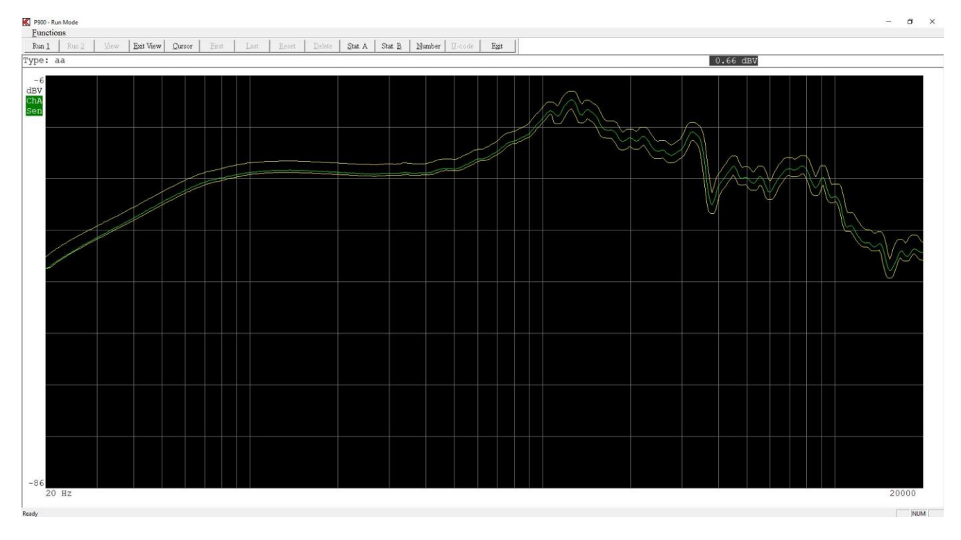
Figure 4: Device as used in figure 3 tested in run-mode

Figure 4 show the unit tested as used in figure 3 in run-mode. The complete frequency response has been moved up and down after the sensitivity point test has approved. The totally test is approved.